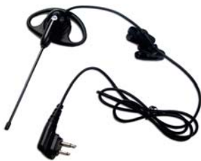
Earpiece with Boom Microphone 56518