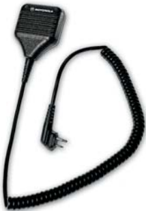
Remote Speaker Microphone HMN9051A