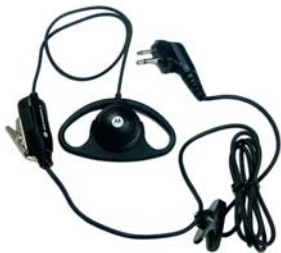
Earpiece with inline PTT & Microphone 56517