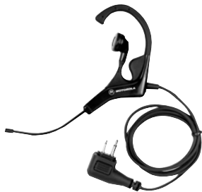
Earpiece with Microphone BDN6774A