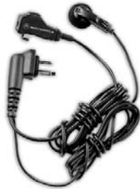
Earbud with PTT Microphone HMN8435A