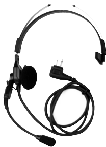
Headset with Swivel Boom Microphone BDN6773A