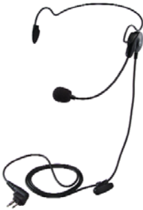
Lightweight Headset with Boom Microphone 53815